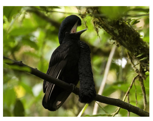
FIGURE 14.1 A male long-wattled umbrellabird in northwest Ecuador. This male in perched on his display territory on a lek, and is in the act of regurgitating a palm seed.

"Vulnerable" to extinction, due primarily to widespread deforestation in this area (BirdLife International, 2000; IUCN, 2011). Umbrellabirds belong to the neotropical family Cotingidae, a group known for lekking behavior and exuberant secondary sexual characteristics (Snow, 1982). As is typical for lek-breeding species, males and females exhibit morphological and behavioral attributes that are likely related to their distinctive mating and reproductive strategies. Males are approximately 1.5 times larger than females and have large crests and long wattles, both of which are present but much reduced in females (Tori et al., 2008). Groups of 5–15 males congregate in leks of \sim 1 ha in area, with a peak in sexual display activity in early mornings and late afternoons from August to February, and lower levels of activity at other times of the year (Tori et al., 2008). Most males, which we refer to as "territorial" males, hold small (ca. 25 \text{ m}^2 ), long-term display territories on a single lek, which in turn allows us to link seeds dispersed into these display territories to male umbrellabird mating behavior (see below). Unusually for a lek-breeding bird, males from the same lek often forage together away from the lek in a relatively large, cohesive group (Tori et al., 2008).